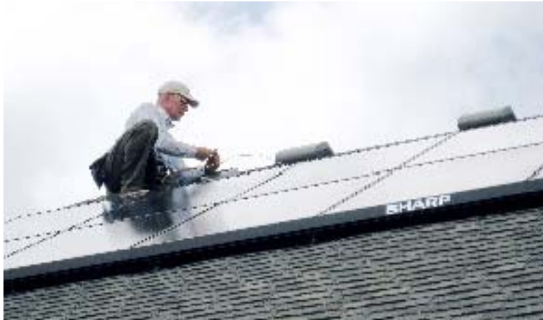
Geothermal and solar installations